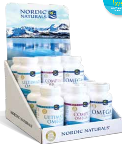
12-BOTTLE COUNTER-TOP DISPLAYS